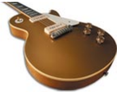
Gibson Custom Shop 1954 Les Paul Goldtop VOS Electric Guitar

In 1957, the Les Paul (and subsequently all electric guitars) was significantly improved with the addition of the newly designed dual-coil "humbucker" pickup, which eliminated electrical hum that that single-coil pickups were prone to produce.