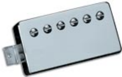
Gibson BurstBucker Pro Humbucker Pickup

In 1957, the Les Paul (and subsequently all electric guitars) was significantly improved with the addition of the newly designed dual-coil "humbucker" pickup, which eliminated electrical hum that that single-coil pickups were prone to produce.