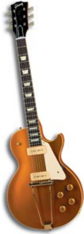
Gibson Custom 1952 Les Paul Goldtop Reissue Electric Guitar